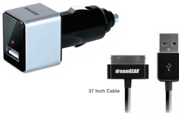
37 Inch Cable