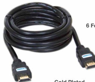
6 Foot Cable