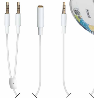
7 Foot Cable