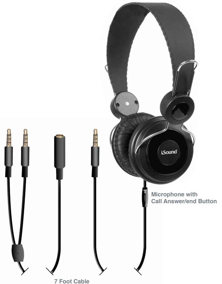
Microphone with Call Answer/end Button